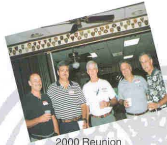
2000 Reunion Sponsored by the FOP